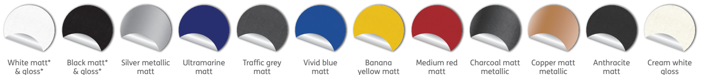
White matt* & gloss*